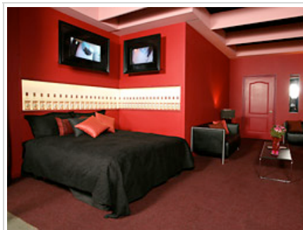
The Razberi suite in the Stoli Hotel.